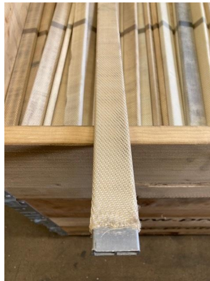
Short space = Length 710 mm